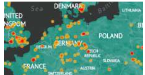
Poland - free from the Islamist attacks happening in other European countries